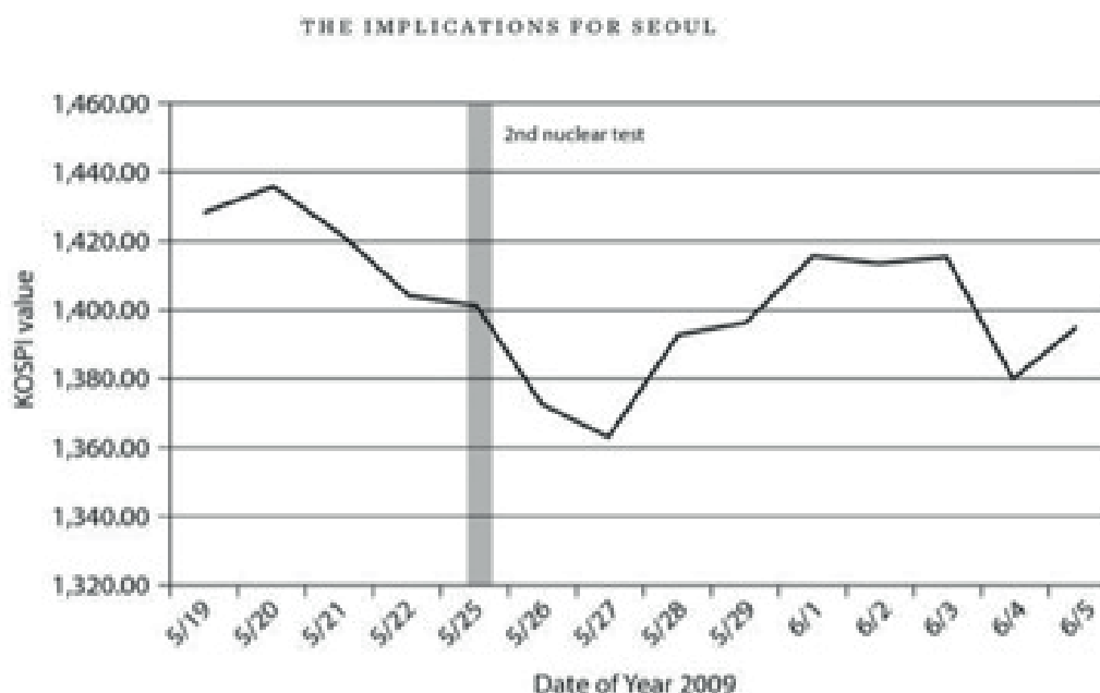
Figure 3.3. Reaction of the Korea Stock Market Index (KOSPI) to the second nuclear test by North Korea, on May 25, 2009.

Harsh international condemnation and its grave concern resulted in adoption of the UN Security Council resolution S/RES/1874 (2009). Underlining once again the importance of non-proliferation